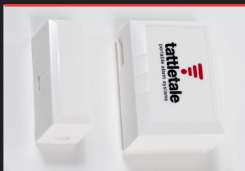
Horizontal Mounting Orientation