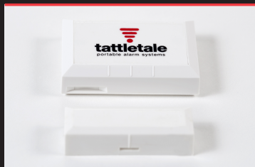
Vertical Mounting Orientation