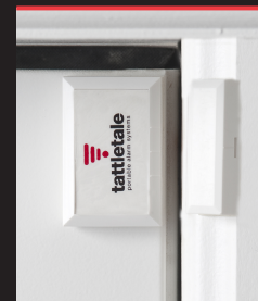
Sensor can be mounted Horizontal [as shown] or Vertical on door/doorframe

Allow 24 hours for the tape to reach maximum strength